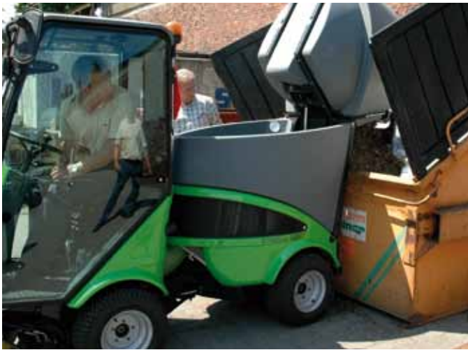
Hydraulic tipping, directly into container