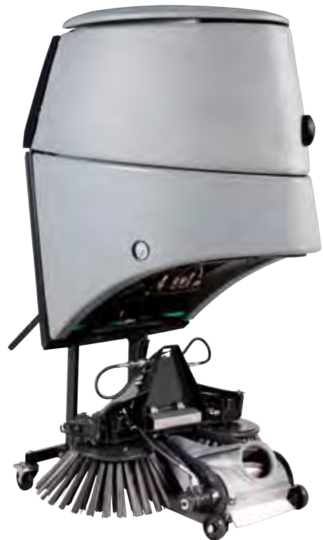
Minimal storage space needed

Fitting the suction sweeper is easy and quick. The attachment is backed in under the hopper, then driven forwards, so the front brushes attach to the A-frame. All the operator then has to do is lock two locking levers, one on the A-frame and one on the hopper. The hydraulics, power, water supply and vacuum hose connect automatically. It is impossible to make a mistake; the two locking levers will not lock if something is amiss.